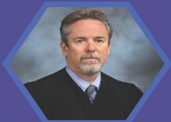
Hon. Kevin G. DeNoce Presiding Judge, Ventura Superior Court