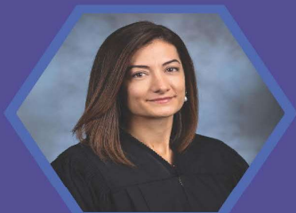
Hon. Marine Dermadzyhan Judge, Ventura Superior Court