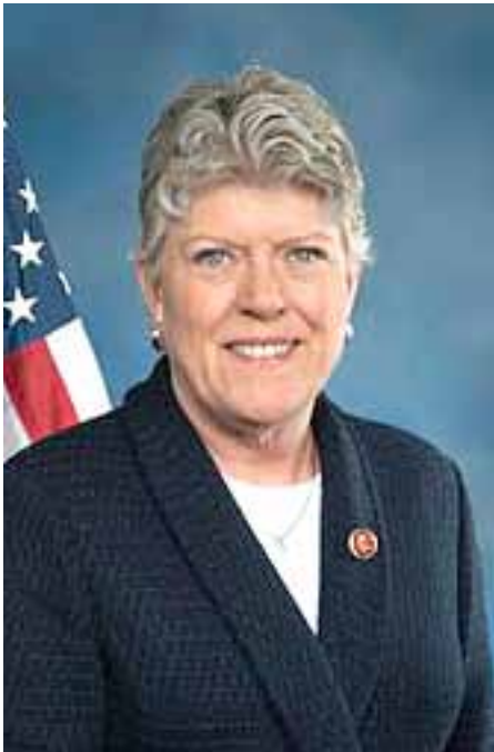
Hon. Julia Brownley