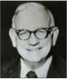
Coach Tommy Prothro