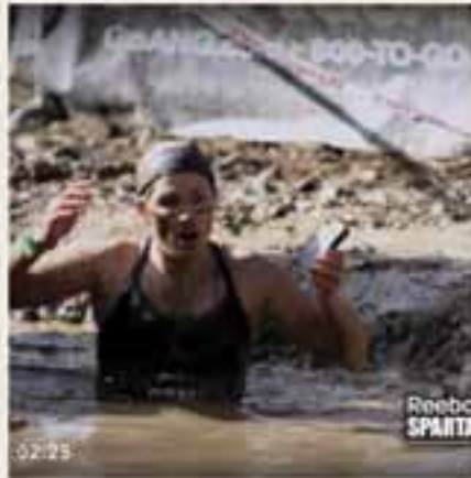
Wifey in 39 degree water