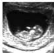
Baby #9 due 5/17/13!

We appreciate your criminal law referrals.